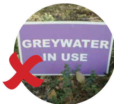
DIAGRAM 3: INCORRECT SIGNAGE WORDING