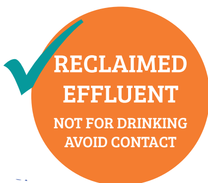
DIAGRAM 2: CORRECT SIGNAGE WORDING