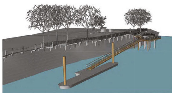
■ Barham pontoon concept drawing.

The next couple of months will see the contractor prepare fabrication and construction drawings. This will be followed by manufacturing of the pontoon and gangways offsite and subsequent installation works in a couple of months. Watch this space!