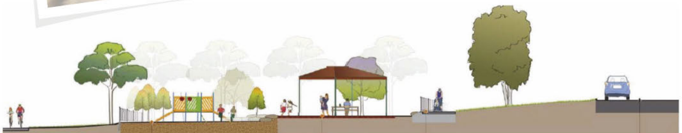
■ Menforth Park upgrades, Tooleybuc concept drawing.