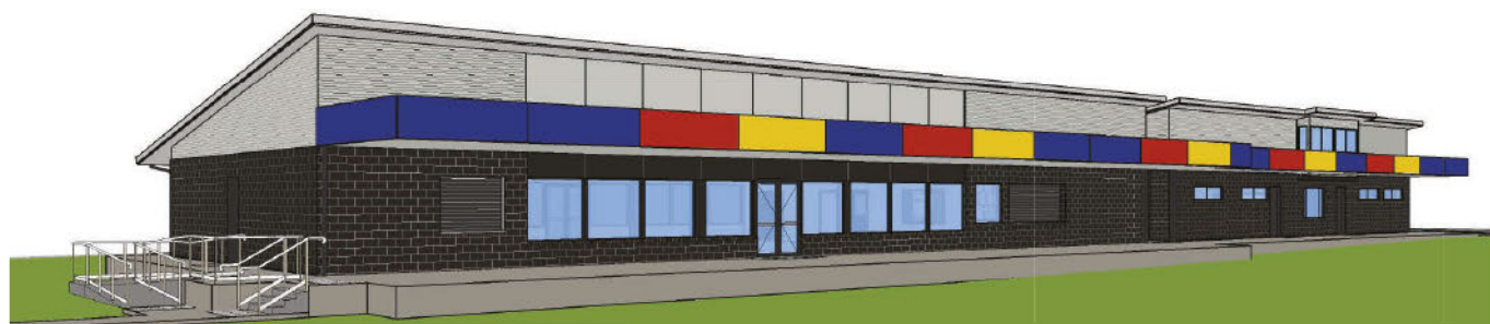
■ Barham Recreation Reserve Multipurpose Pavilion concept drawing.