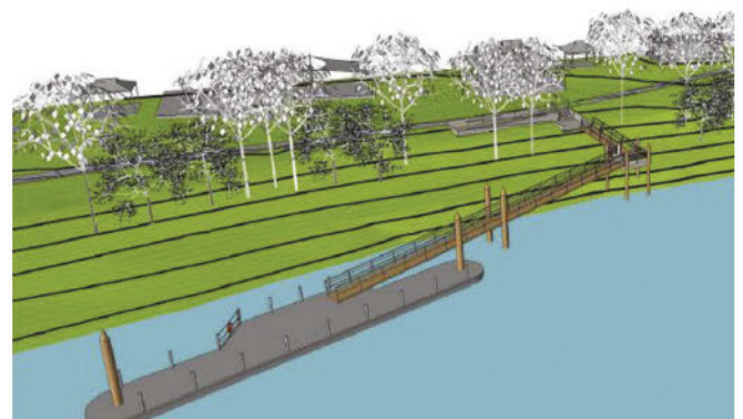
■ Tooleybuc pontoon concept drawing.

Once complete, the pontoon area will have the capacity to serve boats and steam boats and will be a great asset for the local community as well as for tourists in the town of Tooleybuc.