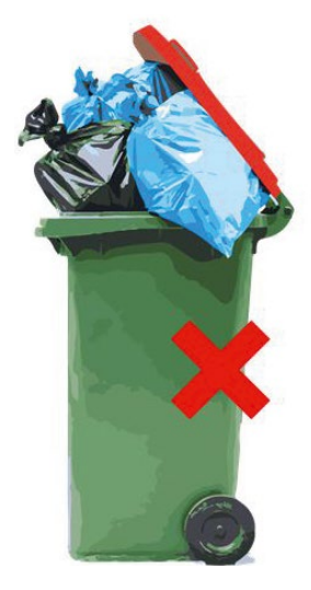
Don't overfill bins!