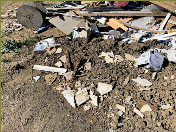
■ Recent site of illegal dumping in Murray Downs.

If you drop waste in the wrong location within the landfill, transfer station or bin station you are technically illegally dumping rubbish and can be fined? This is why it is very important to follow the instructions provided to you by the operators on the site.