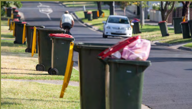
■ Good and bad bin lid management.

If the lid on your bin does not close, you run the risk of your bin not being emptied? The arms on the trucks that lift the bins are only able to lift so much and if your bin is heavier than the truck can lift, it may end up with your bin not being emptied.