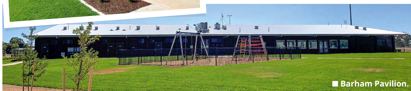
■ Barham Pavilion.

The pavilion amenities are also receiving a facelift with the installation of new plumbing fittings, new tiling, lighting, roof, floor and wall repairs, along with a fresh paint job.