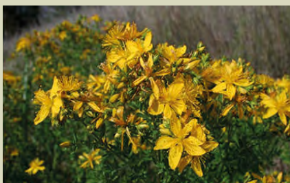
St Johns Wort