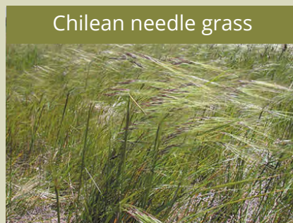
Chilean needle grass