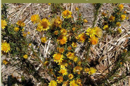
Sticky everlasting daisy