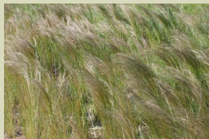
Native spear grass